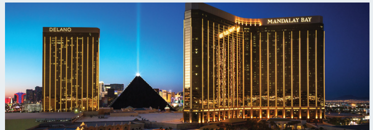
Exhibit Hall open on Tuesday, Feb. 25, 3:15-5 p.m., and Wednesday, Feb. 26, 11 a.m.-3 p.m.

Mandalay Bay Resort & Casino—Bayside 3950 S. Las Vegas Blvd., Las Vegas, NV 89119