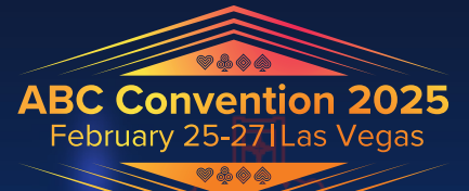
Exhibit Hall Booth Packages